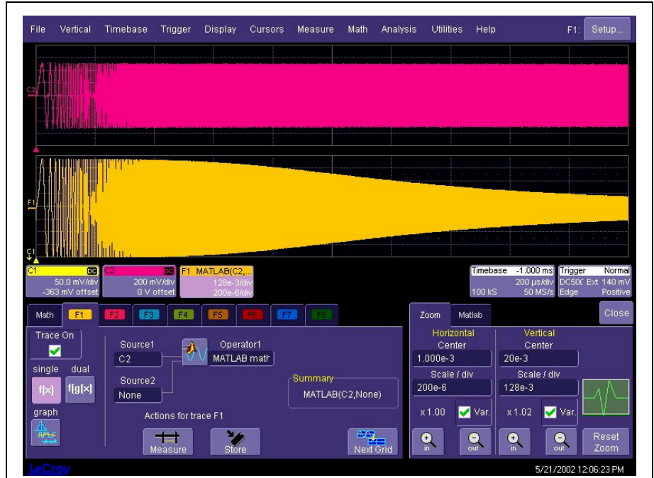
Figure 1 The response of a MATLAB based 2 pole Butterworth filter (lower trace) to a swept sine input (upper trace).

The .m file used in this example is shown in figure 3. The filter type used is a Butterworth lowpass filter. MATLAB offers a choice of some 7 filter types. This filter is a relatively slow cutoff second